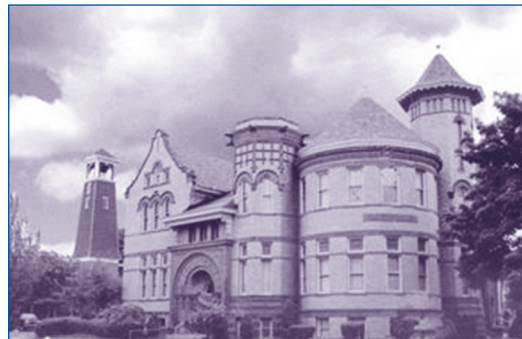
Lenawee County Historical Museum in Adrian, Michigan.

Lenco Credit Union is large enough to offer access to a full range of financial services, yet small enough to offer a level of personal attention not found at large financial institutions. We are here to provide you with a place to save and to obtain loans at a reasonable rate. If you are borrowing and banking elsewhere, the question is why?